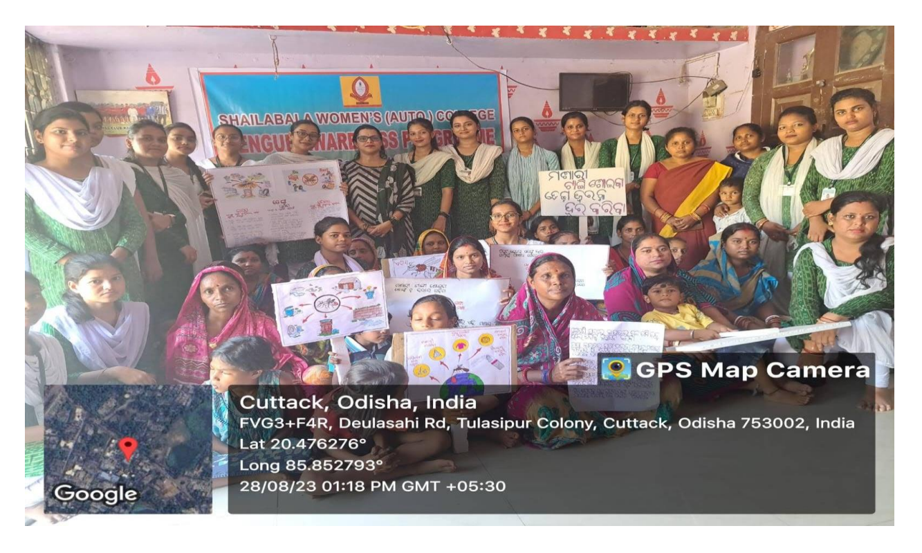
Dengue Awareness Program organized by P.G. Department of Sociology, dt-28/08/2023