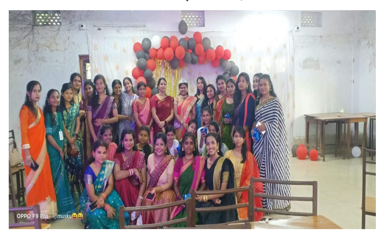
PG 1st Year's Freshers Day Celebration, dt-30/09/2023