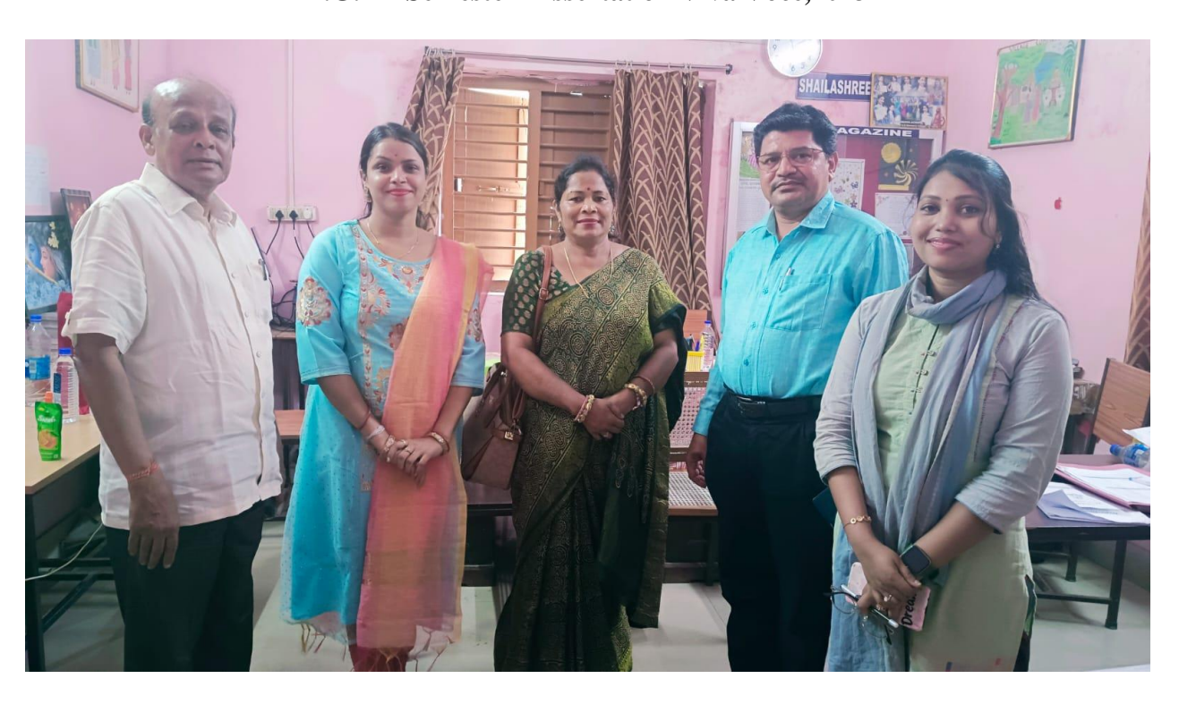
Board of Studies Meeting dt-22/06/2023