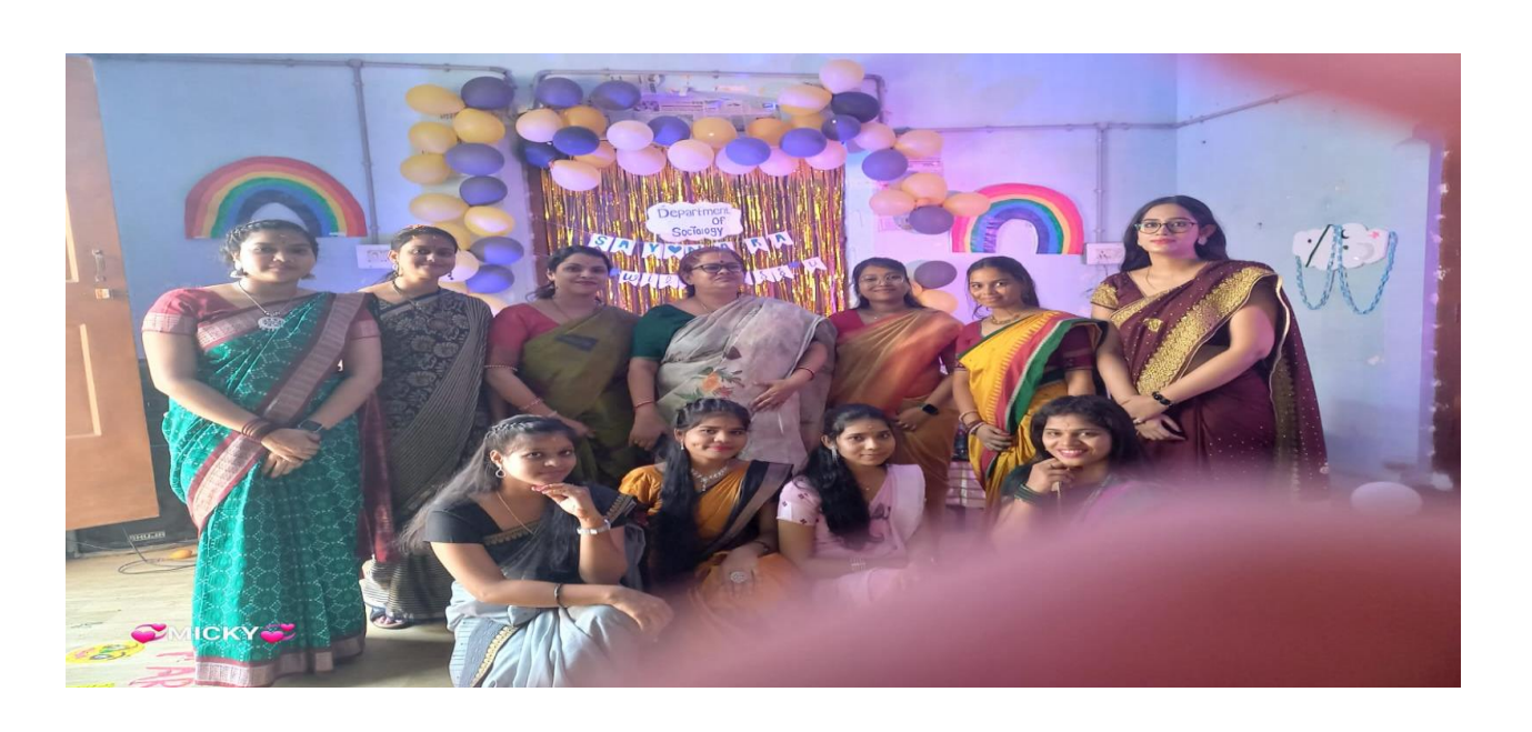
Faculties and students with our Honorable Principal Madam on the occasion of P.G. 2^{nd} Farewell party, 2023.