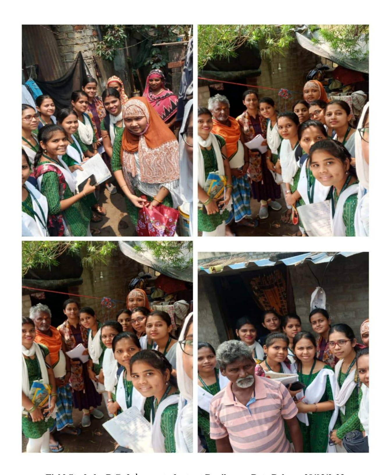
Field Study by P.G. 2^{nd} year students at Buxibazar, Pata Pola on 29/03/2-23