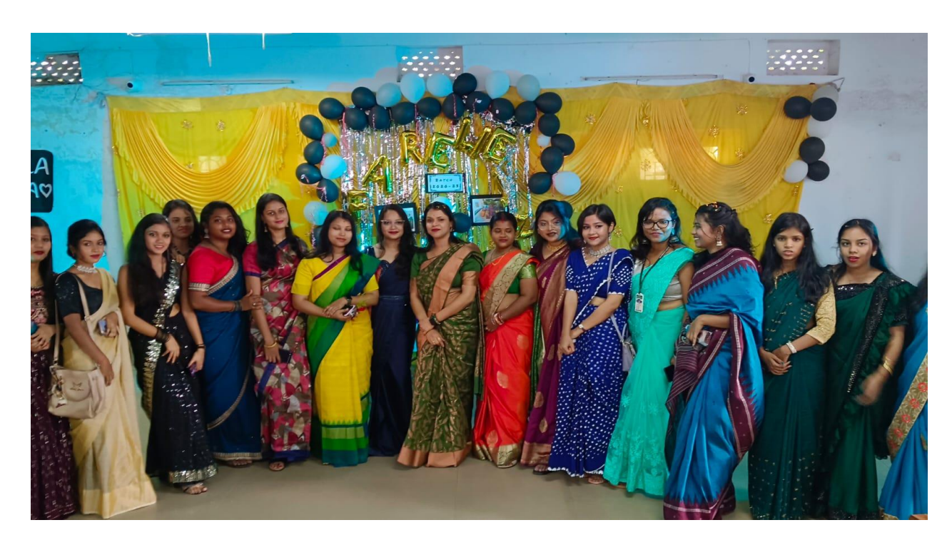
UG Farewell Party, 2023 pass out batch