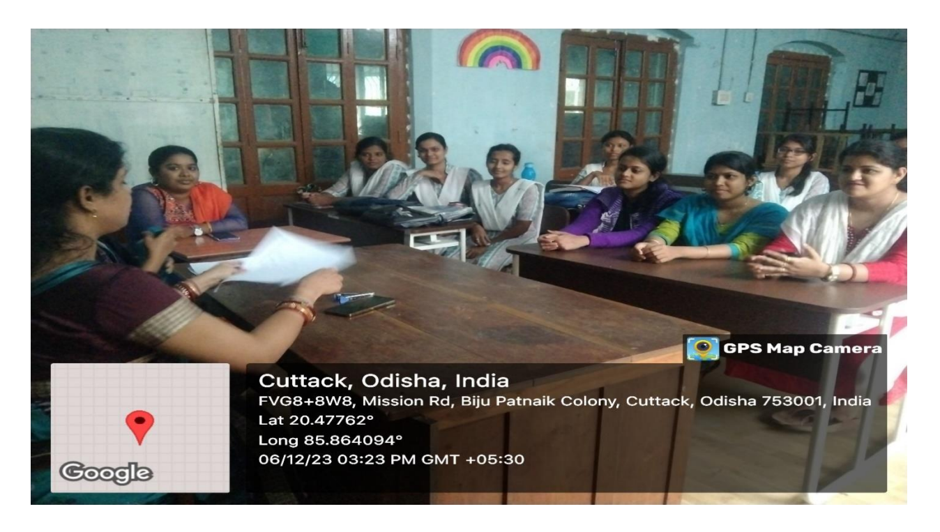
Departmental Weekly Seminar