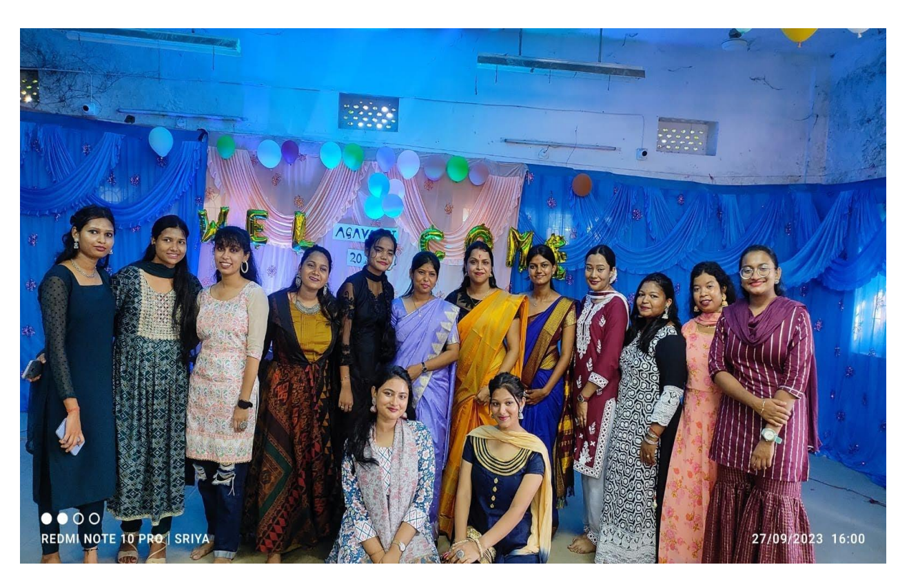
UG 1st Year's Freshers Day Celebration, dt- 27/09/2023