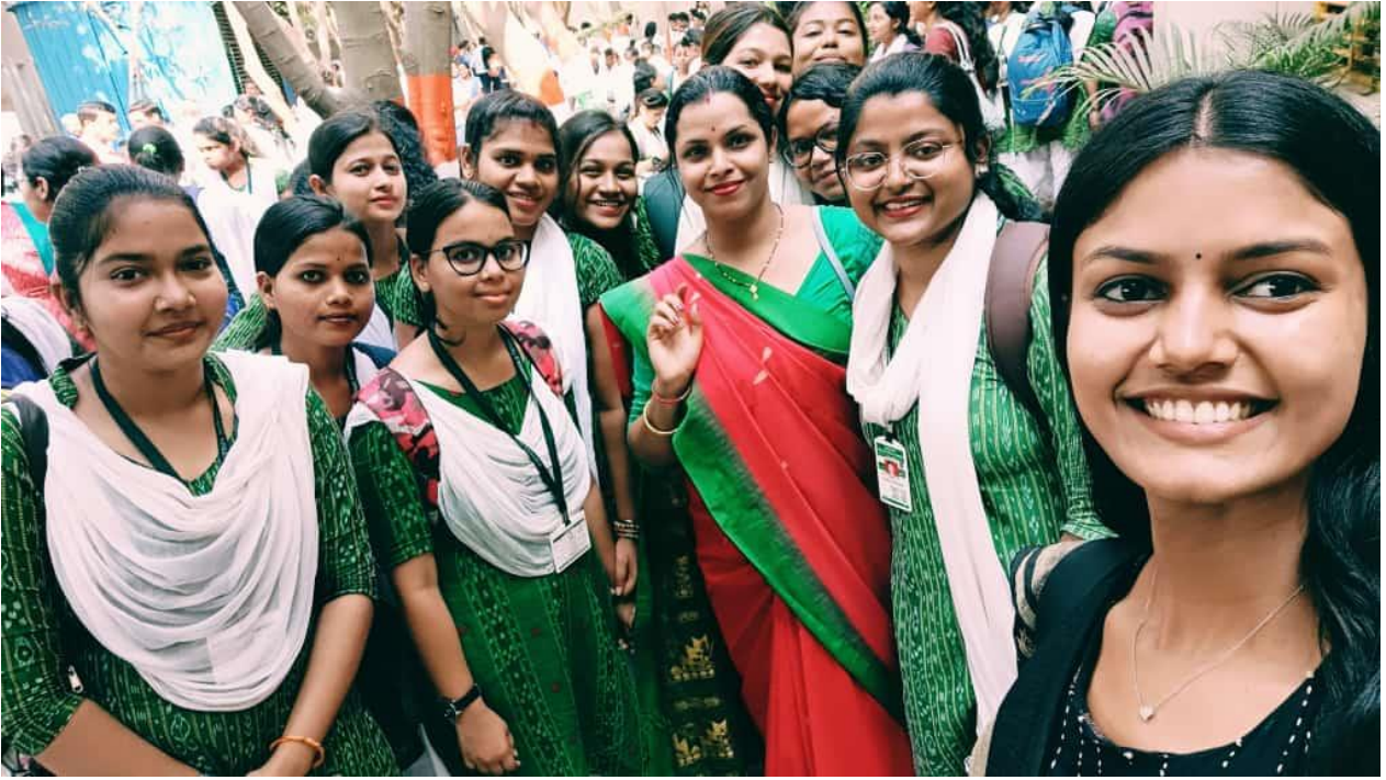
Students Out Reach Program at KIIT Deemed to be University, BBSR on 25/02/2023