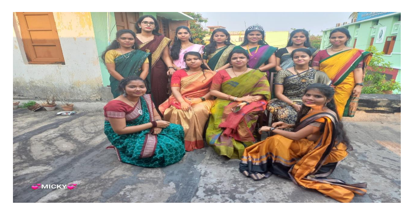
PG Farewell Party, 2023 pass out batch