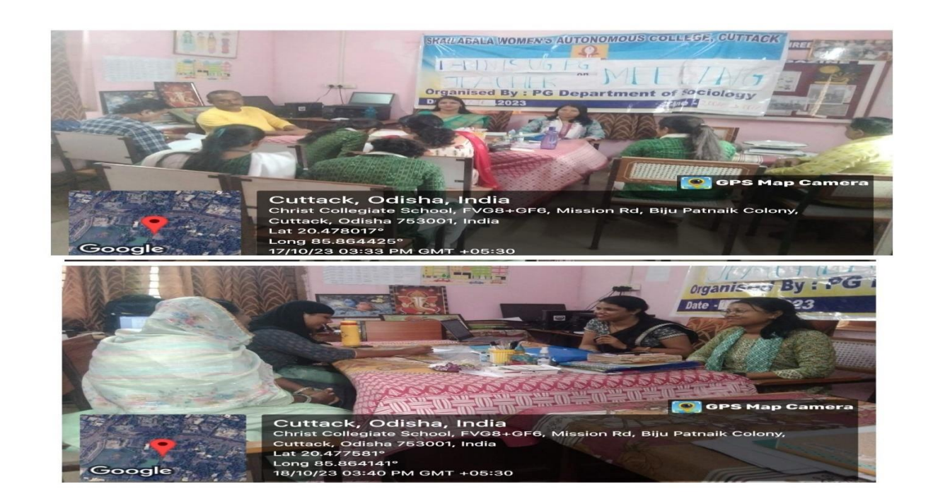
Parent Teacher Meeting of U.G. and P.G. Students