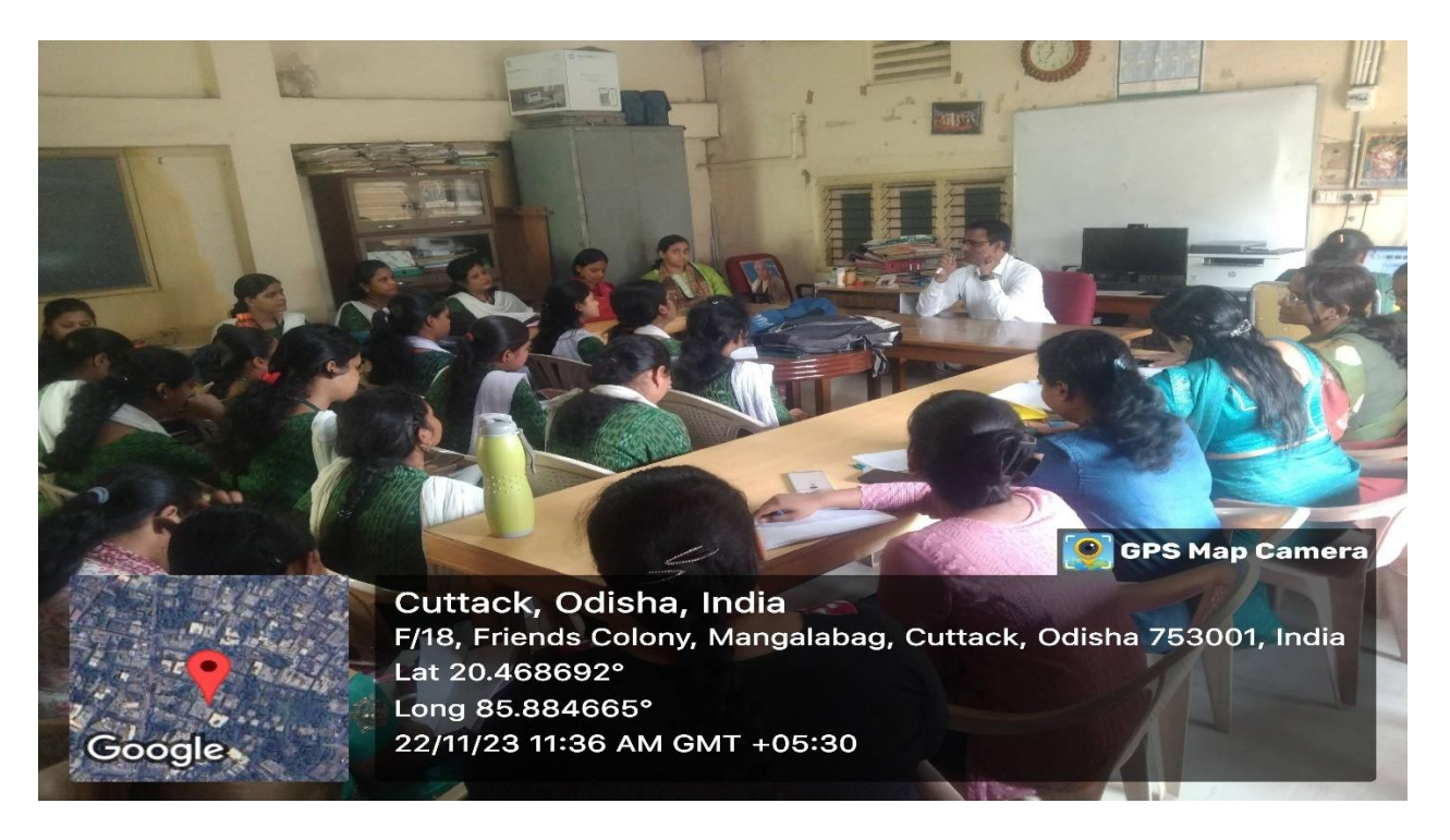
Field Internship Training Session at OMRAH