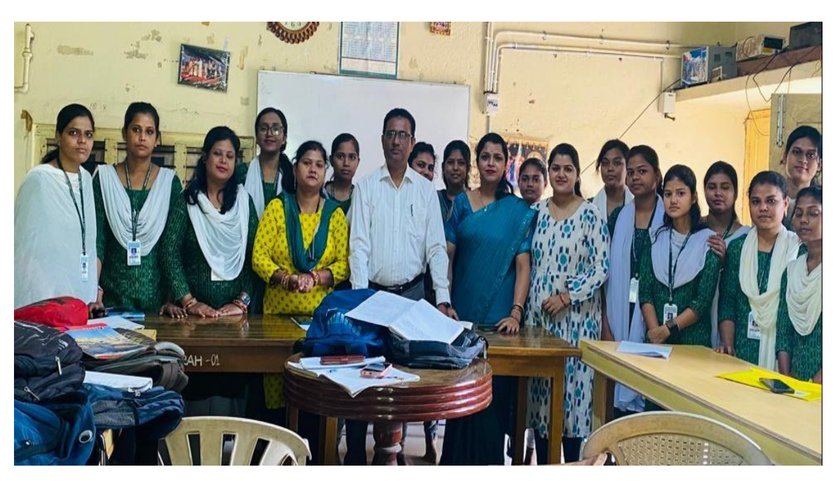
Field Internship at OMRAH, Cuttack of P.G. 2<sup>nd</sup> year students