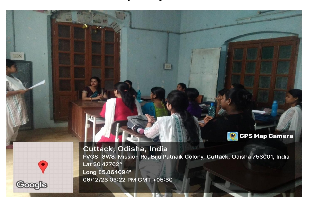
Departmental Weekly Seminar