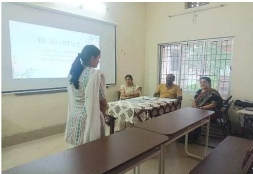
29/11/2024- INTERNSHIP VIVA OF PG 2 ND YEAR POLITICAL SCIENCE