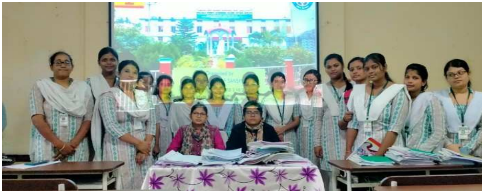
29/11/2024- PG INTERNSHIP VIVA VOCE IN DEPARTMENT OF SANSKRIT