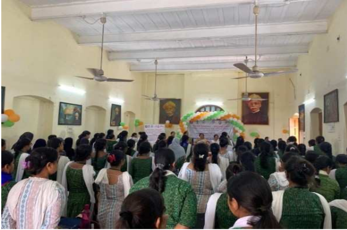
13/03/2024- YUVA SAMVAD: INDIA @2047 SPONSORED BY NSS, REGIONAL DIRECTORATE, BHUBANESWAR, DEBATE COMPETITION ON “VIKASIT BHARAT @2047” AND PANCH PRAN PLEDGE TAKING