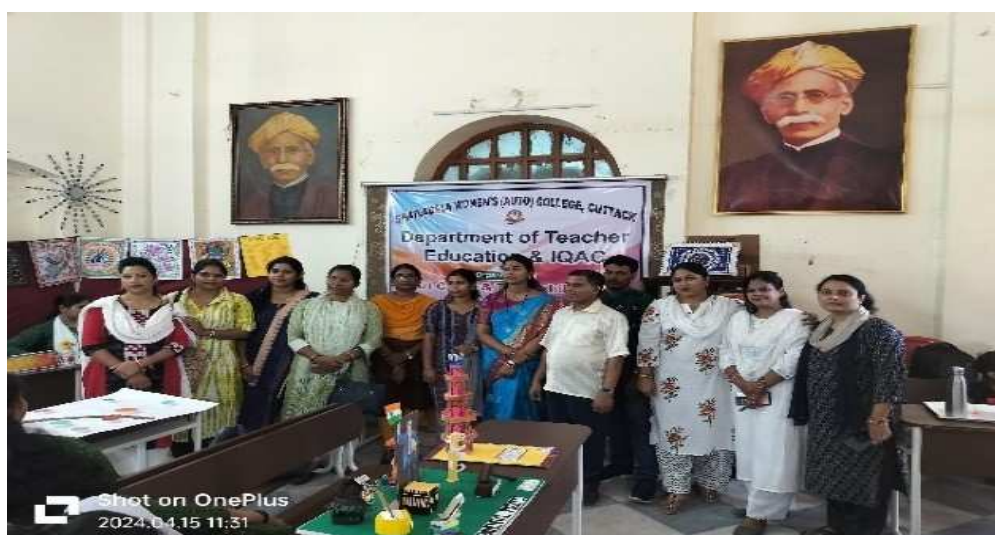
15-04-2023- ART AND TEACHING LEARNING MATERIAL EXHIBITION ORGANISED AT DEPARTMENT OF TEACHER EDUCATION