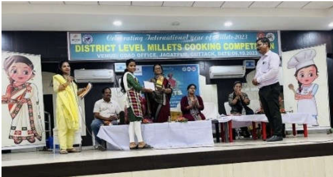
06/02/2023-DISTRICT LEVEL MILLET COOKING COMPETITION