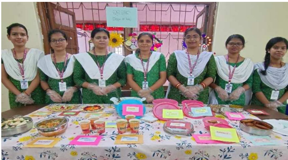
28/04/2025- FOOD PRESERVATION EXHIBITION IN DEPARTMENT OF TEACHER EDUCATION