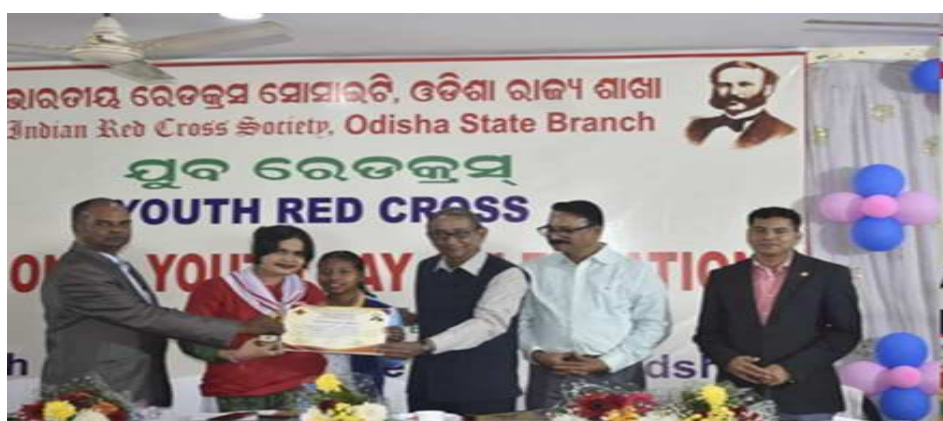
12/01/2025- PARTICIPATION IN COMPETITIONS ORGANISED BY YOUTH RED CROSS, ODISHA