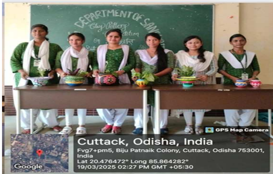
19/03/2025- CLAY POTTERY COMPETITION IN DEPARTMENT OF SANSKRIT