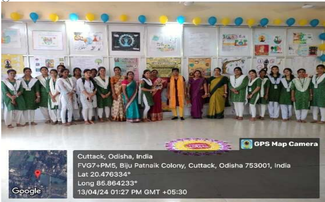
13/04/2024- ART & POSTER EXHIBITION ON INDIAN KNOWLEDGE SYSTEMS IN DEPARTMENT OF SANSKRIT