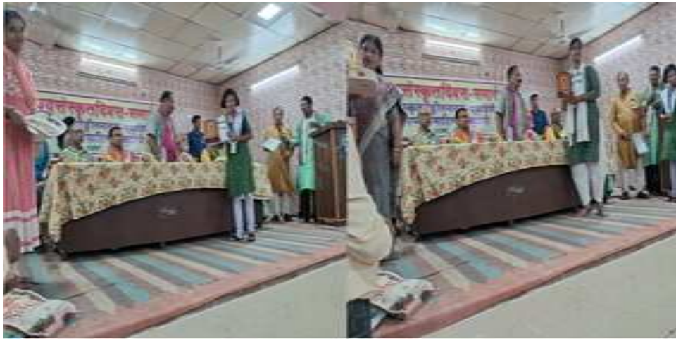
24/08/2024-PARTICIPATION OF STUDENTS IN DEBATE COMPETITION CONDUCTED BY THE MEMBERS OF SAMSKRUTA SAHITYA ACADEMY