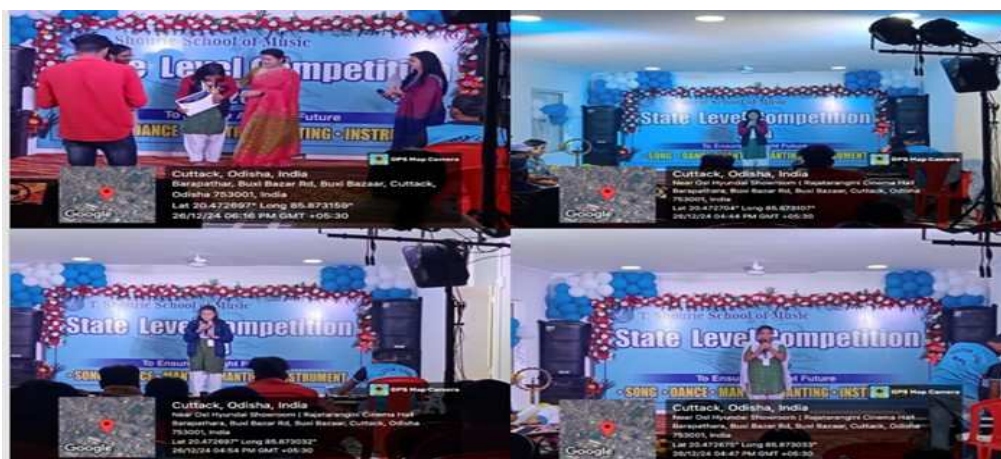
26/12/2024- STATE LEVEL MUSIC AND DANCE COMPETITION