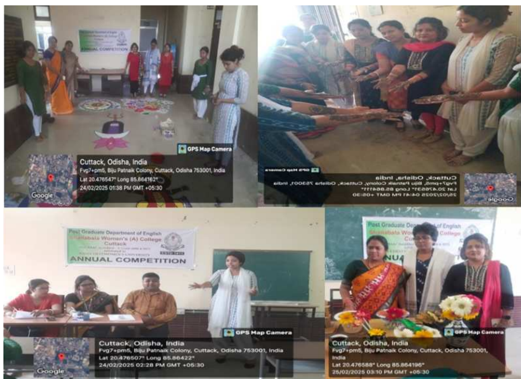
24/02/2025 TO 25/02/2025- COMPETITIONS IN DEPARTMENT OF ENGLISH