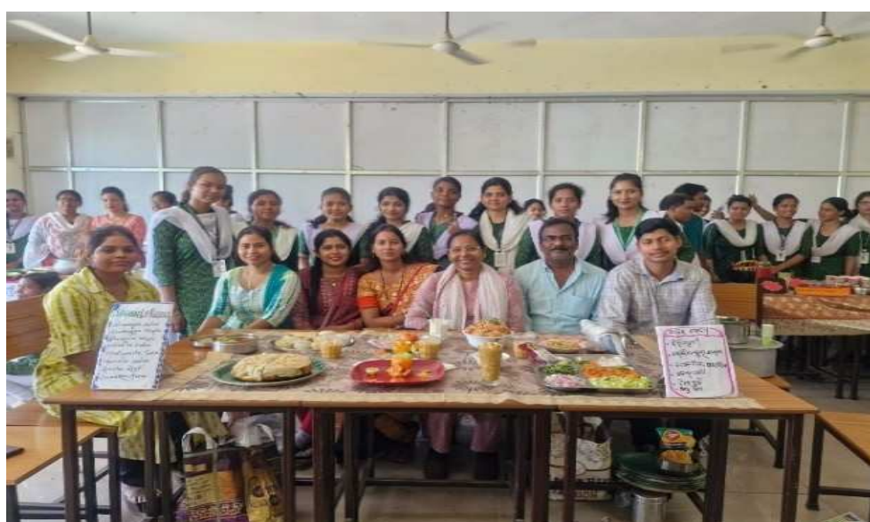
20/04/2024- EXHIBITION ON FOOD PROCESSING & FOOD PRESERVATION ORGANISED AT DEPARTMENT OF TEACHER EDUCATION