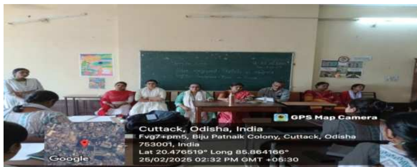
24/02/2025- CO-CURRICULAR COMPETITIONS IN DEPARTMENT OF EDUCATION