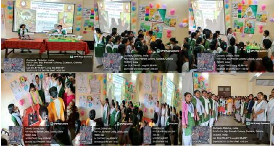
20/01/2025- MODEL & POSTER PRESENTATION ON IMPORTANCE OF AYURVEDA BY DEPARTMENT OF SANSKRIT