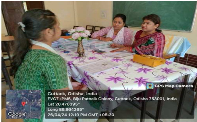
26/04/2024- DISSERTATION VIVA OF PG STUDENTS IN DEPARTMENT OF SANSKRIT