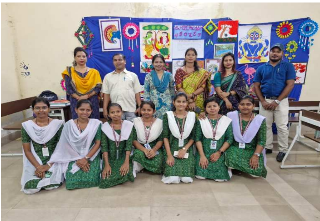
26/04/2025- ART EXHIBITION IN DEPARTMENT OF TEACHER EDUCATION