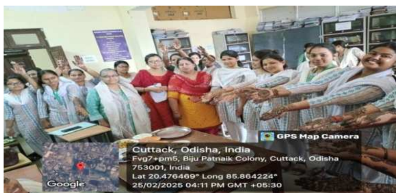
25/02/2025- EXTRACURRICULAR COMPETITIONS IN DEPARTMENT OF EDUCATION