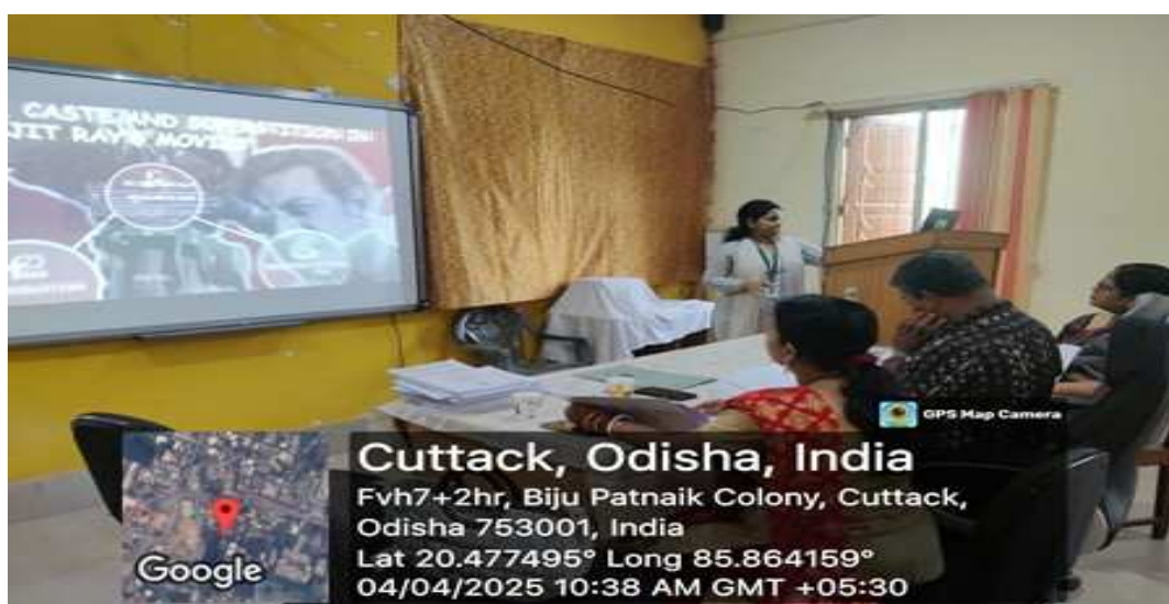
04/04/2025- PG DISSERTATION VIVA OF ENGLISH