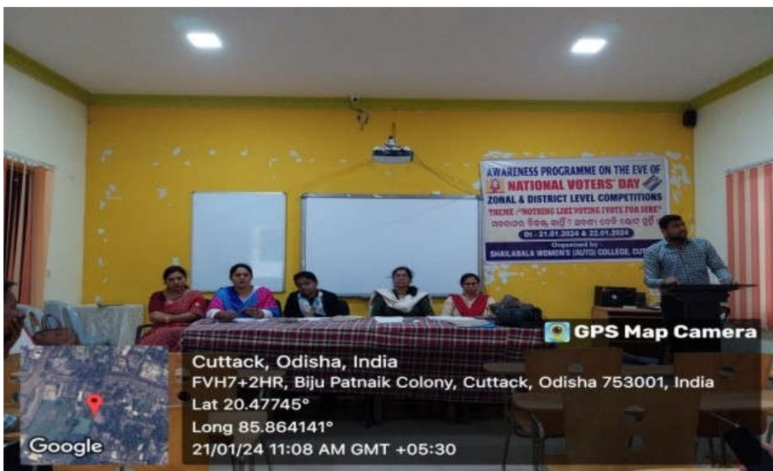
21/01/2024- ZONAL AND DISTRICT LEVEL COMPETITIONS ON " NOTHING LIKE VOTING, I VOTE FOR SURE" ON NATIONAL VOTER'S DAY