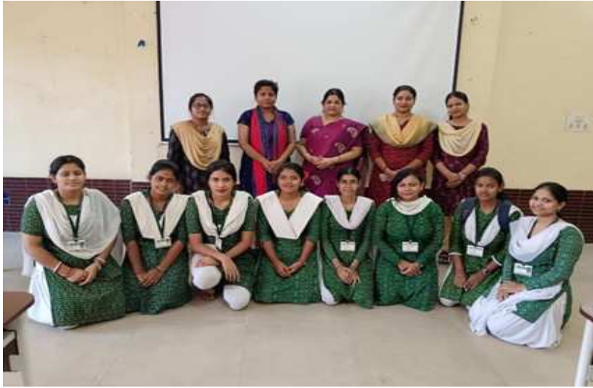
23/04/2024- UG PROJECT VIVA VOCE IN DEPARTMENT OF SANSKRIT