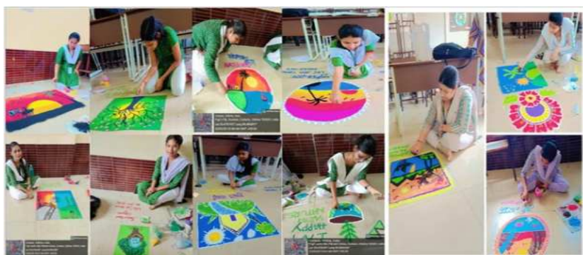
22/02/2025- RANGOLI COMPETITION IN DEPARTMENT OF SANSKRIT