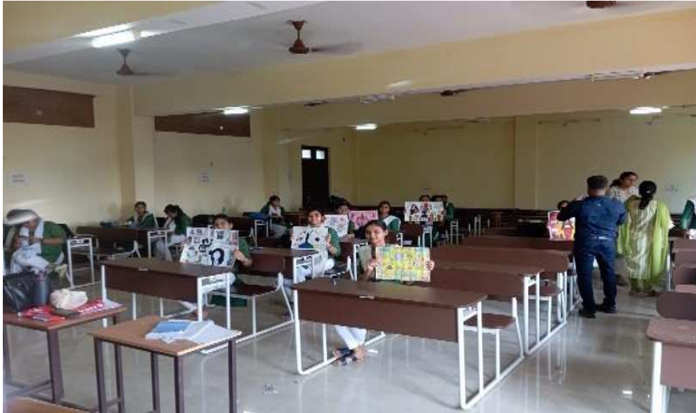
05/04/2025-ESSAY AND DEBATE COMPETITIONS IN DEPARTMENT OF COMMERCE