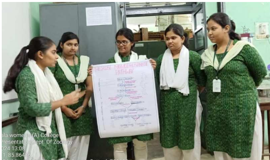
30/03/2024-POSTER PRESENTATION BY STUDENTS ON BIOCHEMICAL PATHWAYS