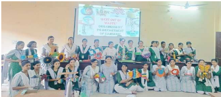
21/02/2025- BEST OUT OF WASTE COMPETITION IN DEPARTMENT OF SANSKRIT