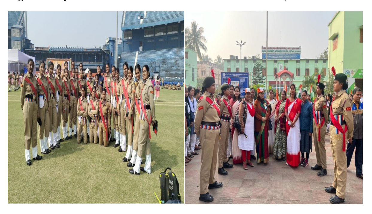
Institutional training class by PI staff on 27/02/2024

Like every year NCC cadets participated in College Parade and parade organized by District Administration at Barabati Stadium, Cuttack.