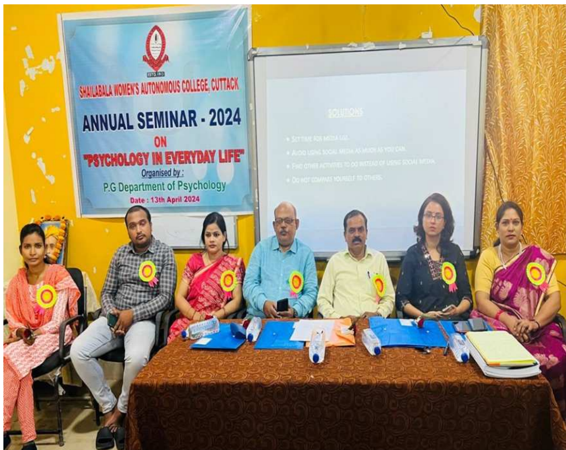
13/04/2024- SEMINAR ON PSYCHOLOGY IN EVERYDAY LIFE BY DEPARTMENT OF PSYCHOLOGY