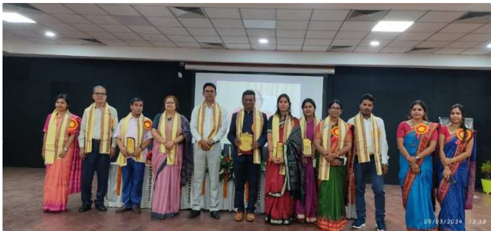
09/03/2024 TO 10/03/2024- NATIONAL SEMINAR ON EDUCATION AND WOMEN EMPOWERMENT BED DEPARTMENT BY DEPARTMENT OF TEACHER EDUCATION