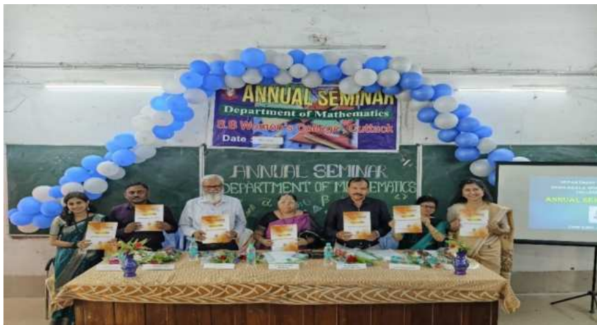
29/03/2025- ANNUAL SEMINAR