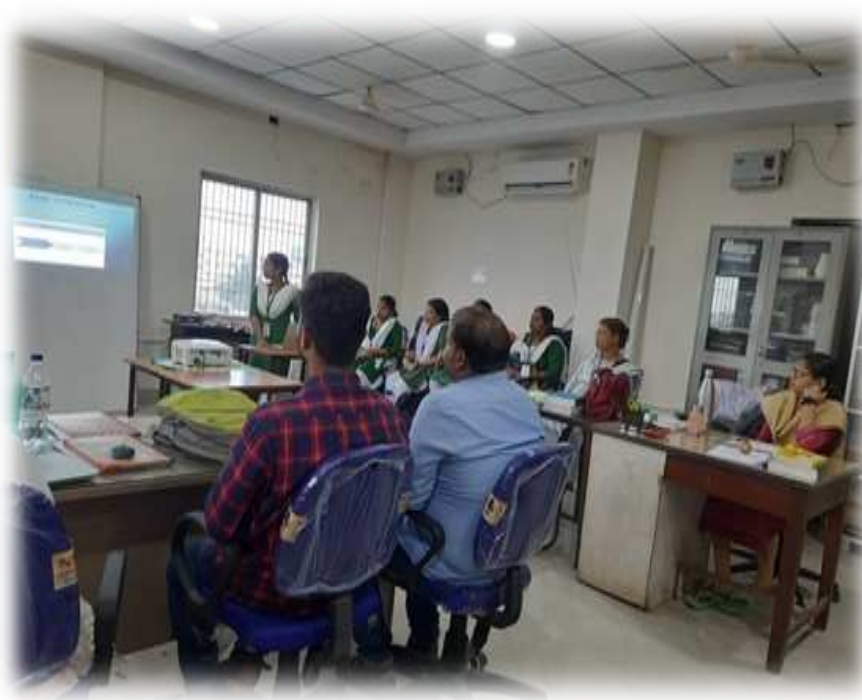
18/09/2024- STUDENTS’ SEMINAR BY DEPARTMENT OF COMPUTER SCIENCE