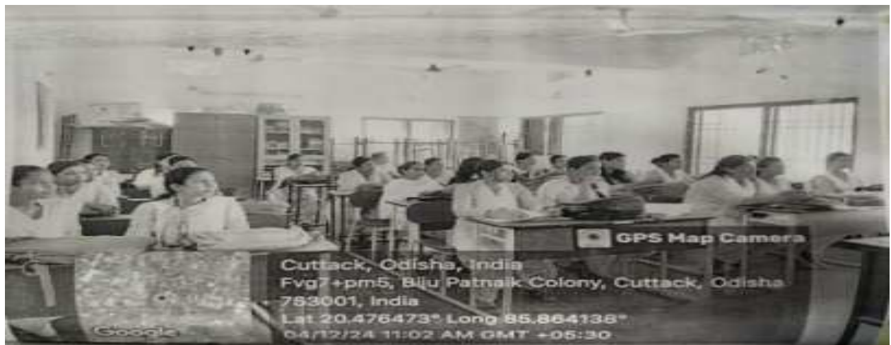
04/12/2024- SEMINAR (P.G FIRST YEAR) IN DEPARTMENT OF HISTORY