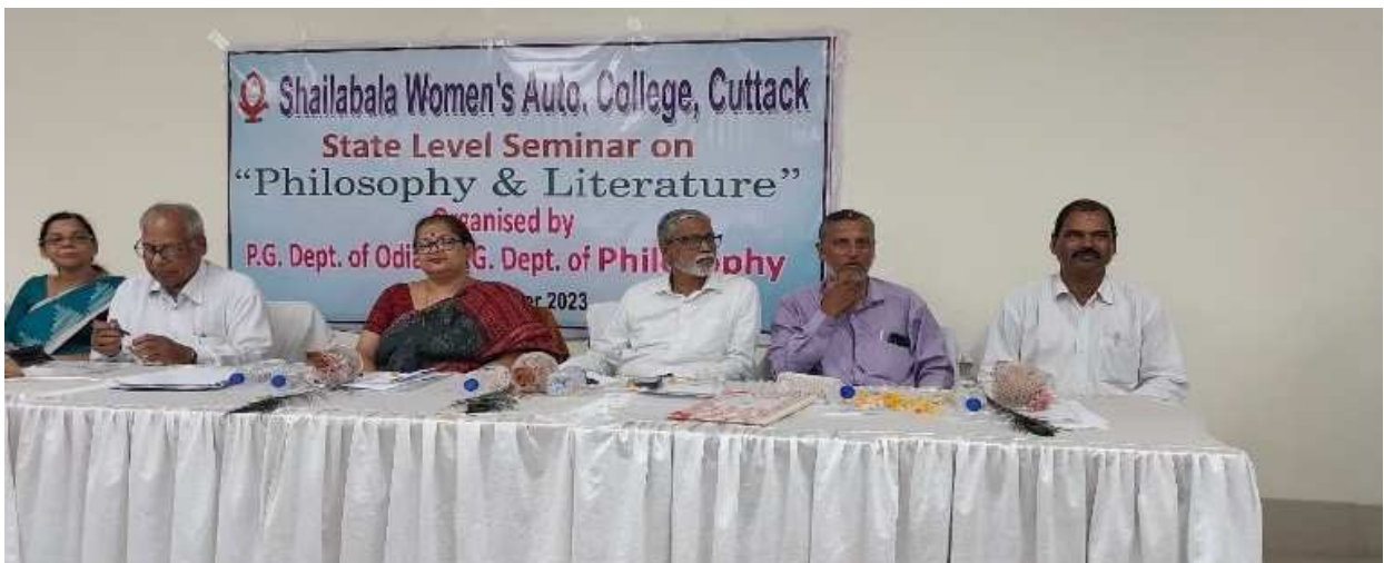
5/9/2023- STATE LEVEL SEMINAR IN DEPARTMENT OF PHILOSOPHY ON THEME "PHILOSOPHY ANF LITERATURE"