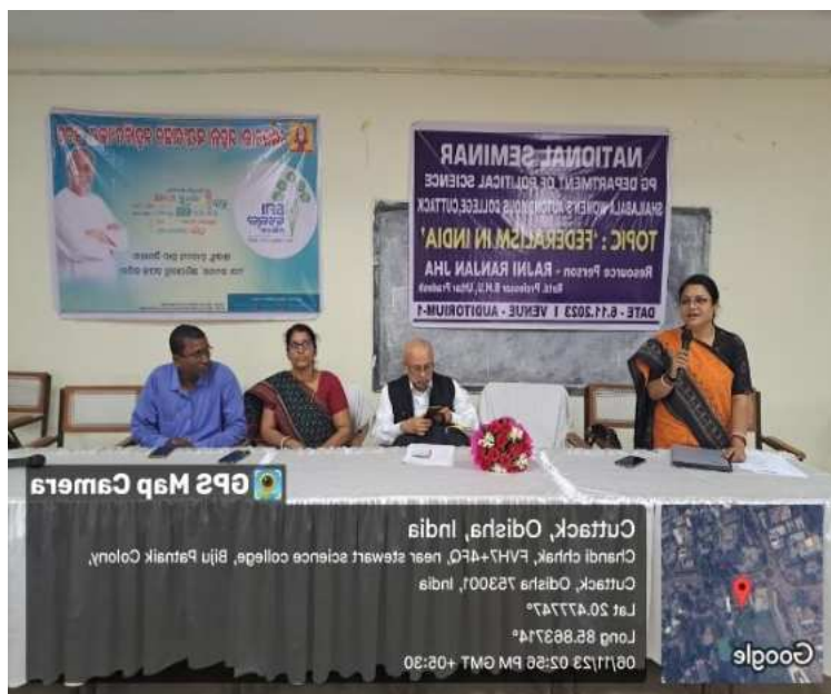
06/11/2023- DEPARTMENTAL SEMINAR ORGANISED BY DEPARTMENT OF POLITICAL SCIENCE