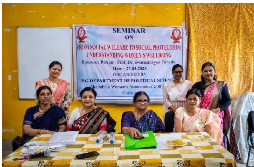
27/03/2025- GUEST SEMINAR ON TOPIC “FROM SOCIAL WELFARE TO SOCIAL PROTECTION: UNDERSTANDING WOMEN’S WELLBEING” BY DEPARTMENT OF POLITICAL SCIENCE