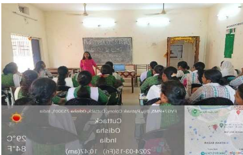
15/03/2024- CAREER COUNSELLING PROGRAMME CONDUCTED BY DEPARTMENT OF SELF-FINANCING