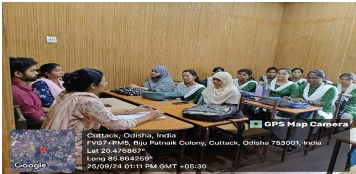
25/09/2024- NEP SENSITIZATION TO AWARE THE STUDENTS ABOUT NATIONAL EDUCATION POLICY 2020 (DEPARTMENT OF LIBRARY & INFORMATION SCIENCE)