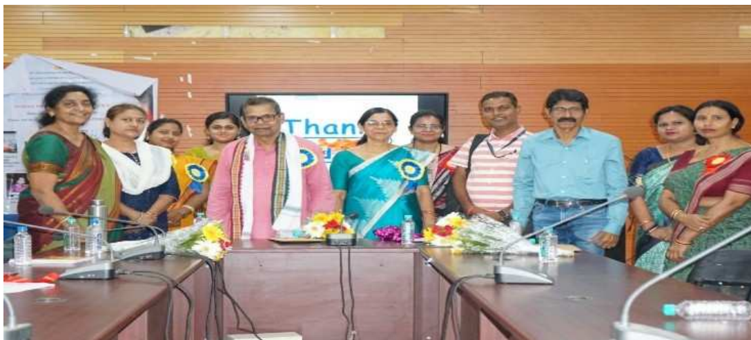
03/04/2025- STATE LEVEL SEMINAR OF DEPARTMENT OF PHILOSOPHY