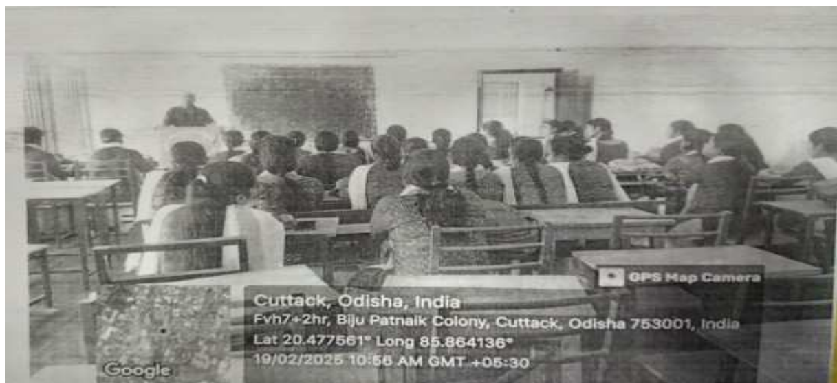
19/02/2025-AWARENESS ABOUT 4-YEAR U.G PROGRAMME IN ODISHA UNDER NEP-2020 IN DEPARTMENT OF HISTORY