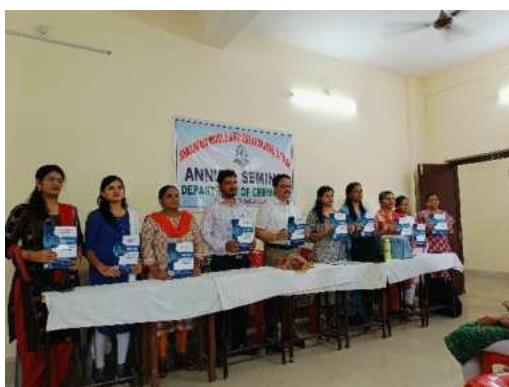
03/04/2024- ANNUAL SEMINAR BY DEPARTMENT OF CHEMISTRY