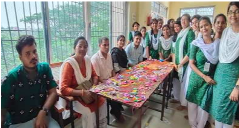
28/08/2023- RAKHI MAKING WORKSHOP AT DEPARTMENT OF TEACHER EDUCATION