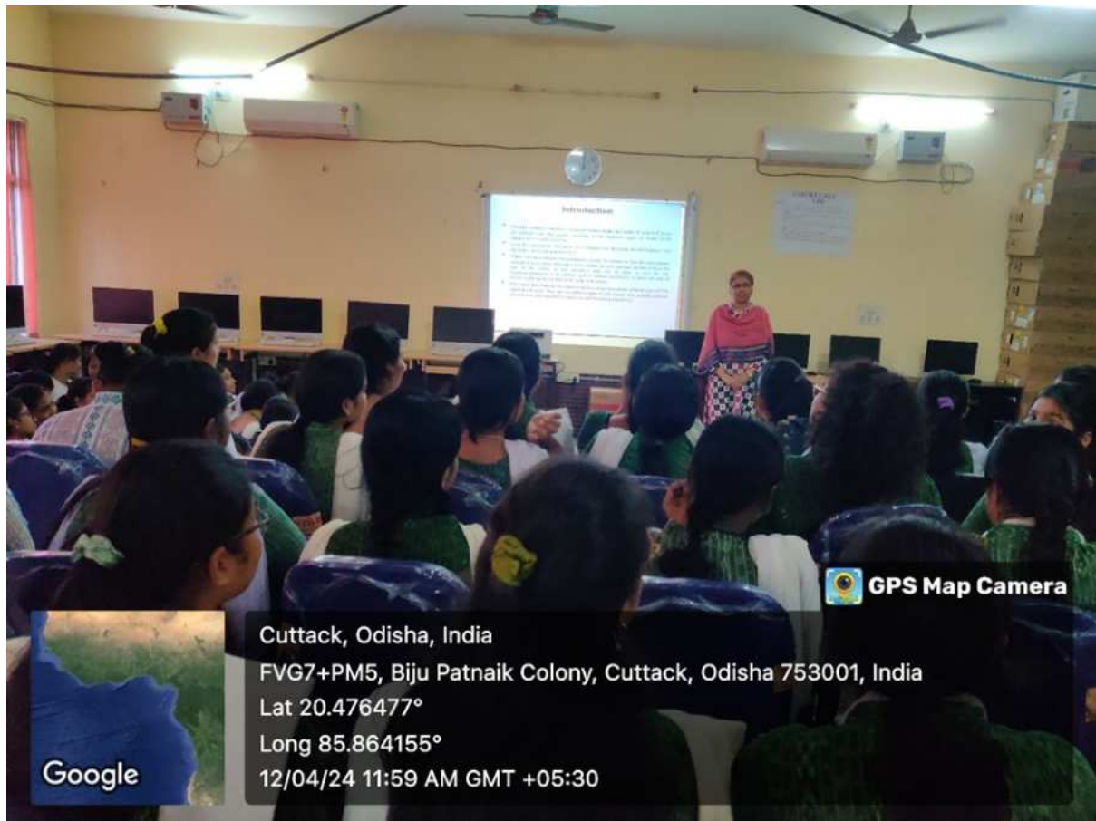
12/04/2024- ANNUAL SEMINAR OF DEPARTMENT OF COMPUTER SCIENCE