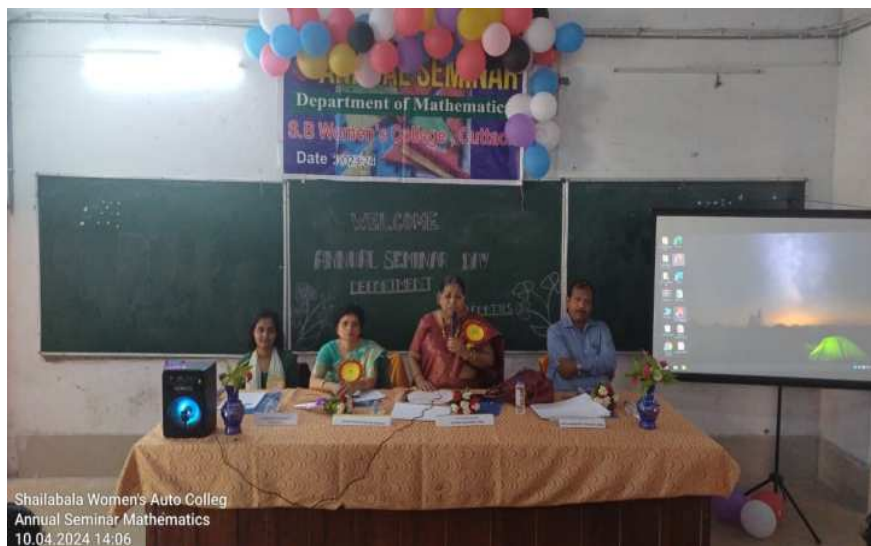
10/04/2024- ANNUAL SEMINAR IN DEPARTMENT OF MATHEMATICS