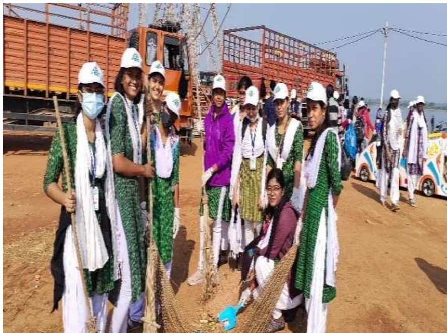
9/12/2023 AND 05/01/2024- CLEANING AT BALIYATRA GROUND AND TALADANDA CANAL AREA