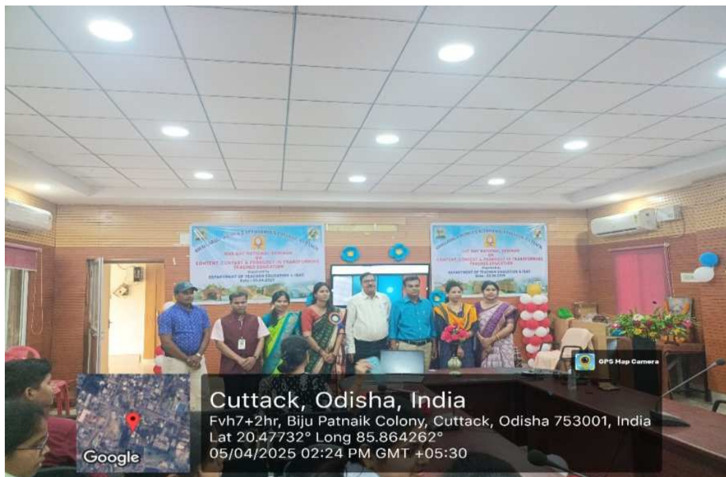
05/04/2025- NATIONAL SEMINAR ON CONTENT, CONTEXT AND PEDAGOGY IN TRANSFORMING TEACHER EDUCATION BY DEPARTMENT OF TEACHER EDUCATION IN COLLABORATION WITH IQAC