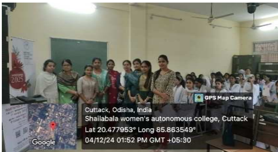
04/12/2024- ANNUAL SEMINAR OF P.G. DPT. OF HOME SCIENCE ONN "REVIVING HANDLOOM- A PATH TO SUSTAINABLE FASHION"; RESOURCE PERSON-