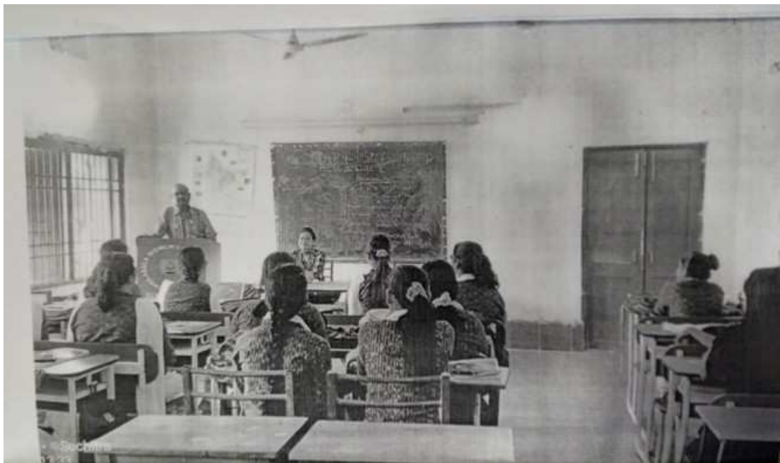
08/11/2024- SEMINAR (U.G. FIRST YEAR) INDEPARTMENT OF HISTORY