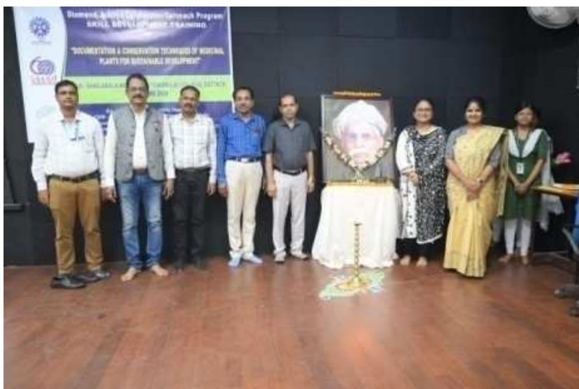
09/08/2024- SKILL DEVELOPMENT PROGRAM ON “DOCUMENTATION AND CONSERVATION TECHNOLOGIES OF MEDICINAL PLANTS FOR SUSTAINABLE DEVELOPMENT”; INVITED SPEAKER-DR. N.K.DHAL, SCIENTIST IMMT, BBSR