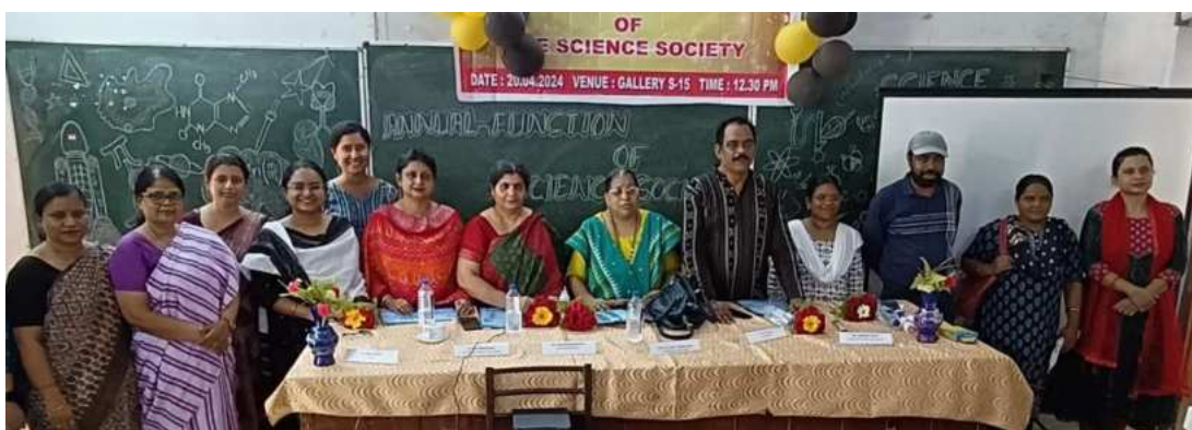
20/04/2024- AANUAL FUNCTION OF THE SCIENCCE SOCIETY