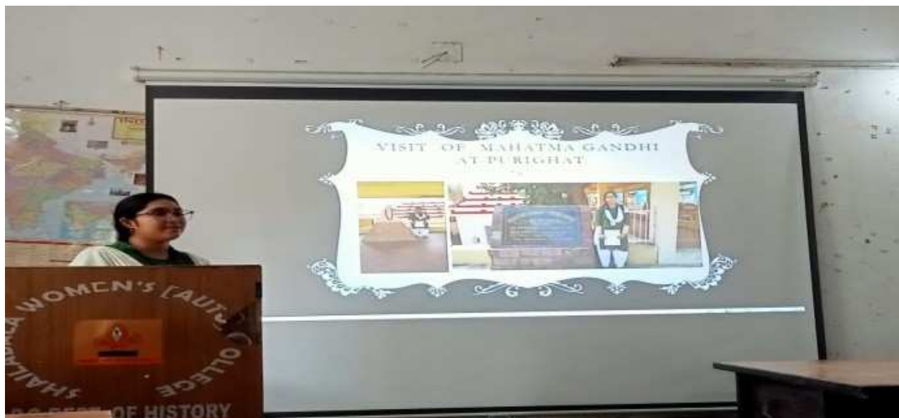
27/03/2025- PRE-PROJECT PRESENTATION SEMINAR (U.G FINAL YEAR) DEPARTMENT OF HISTORY