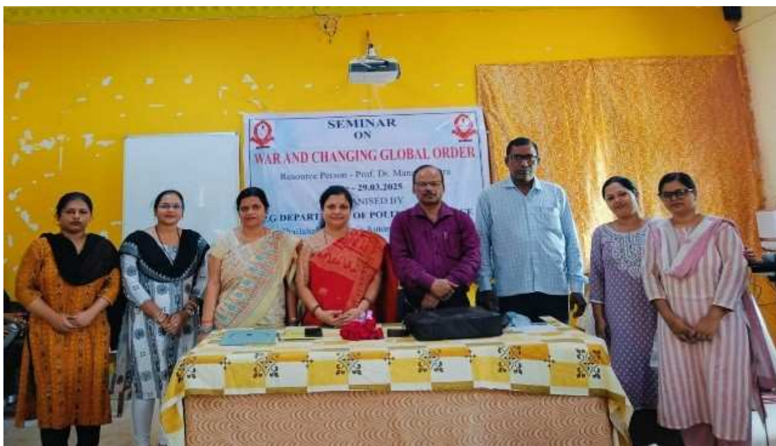
29/03/2025- GUEST SEMINAR ON “WAR AND CHANGING GLOBAL ORDER” BY DEPARTMENT OF POLITICAL SCIENCE