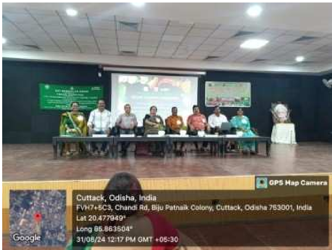
31/08/2024- WORKSHOP ON “EAT GREEN LIVE GREEN”