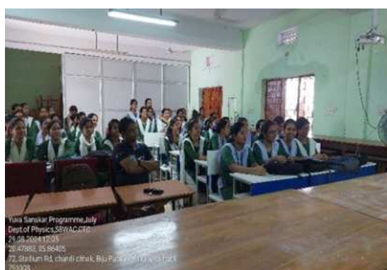
29/08/2024- YUVA SANSKARA PROGRAM IN DEPARTMENT OF PHYSICS