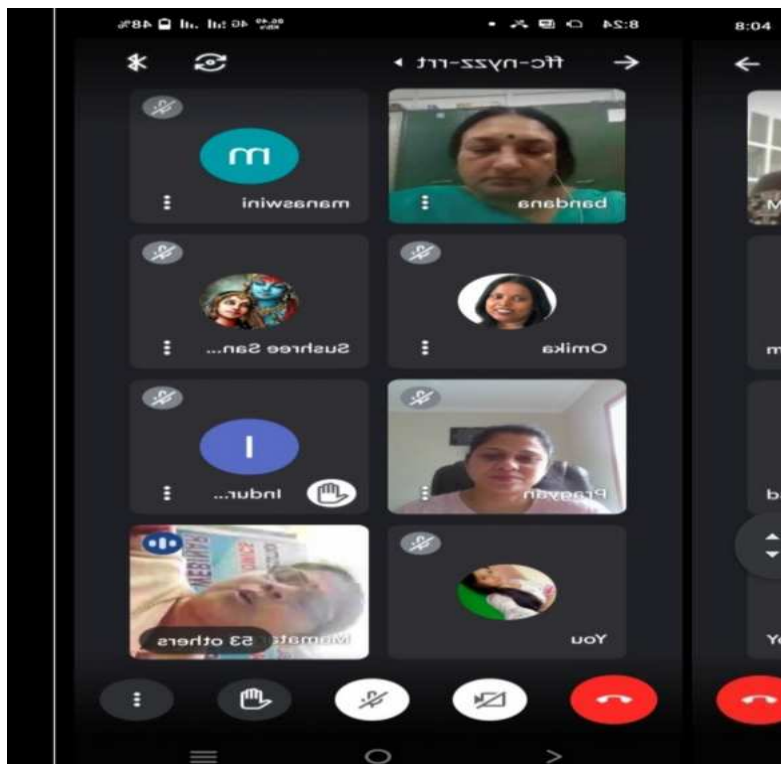
15/04/2023-INTERNATIONAL WEBINAR ORGANISED BY DEPARTMENT OF ECONOMICS