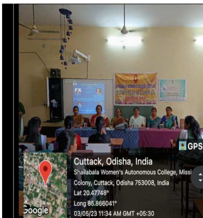
03/05/2023-ANNUAL SEMINAR ORGANISED BY DEPARTMENT OF ECONOMICS