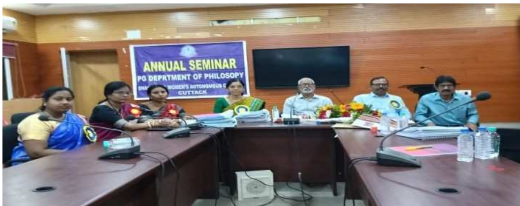
04/04/2025- ANNUAL SEMINAR OF DEPARTMENT OF PHILOSOPHY