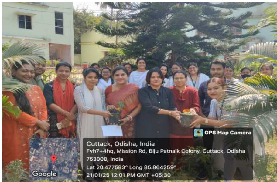
21/01/2025- GREEN INITIATIVES BY DEPARTMENT OF ENGLISH