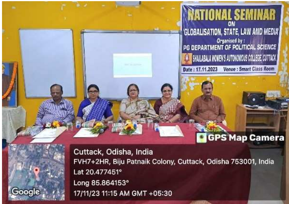
17/11/2023- NATIONAL SEMINAR OF DEPARTMENT OF POLITICAL SCIENCE