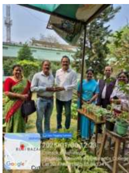
30/01/2025- BEST PRACTICE OF DEPARTMENT OF BOTANY (DISTRIBUTION OF PLANTLETS TO ENCOURAGE GREENARY)