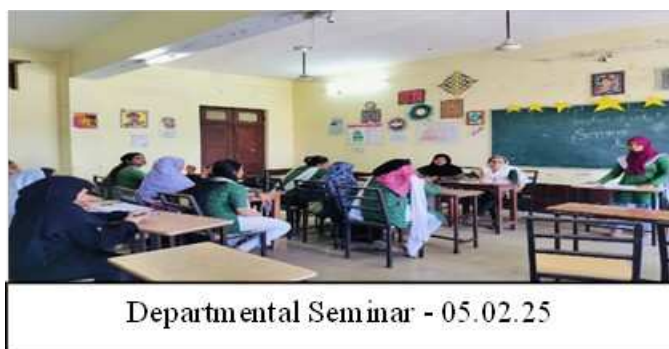
05/02/2025- SEMINAR IN DEPARTMENT OF URDU