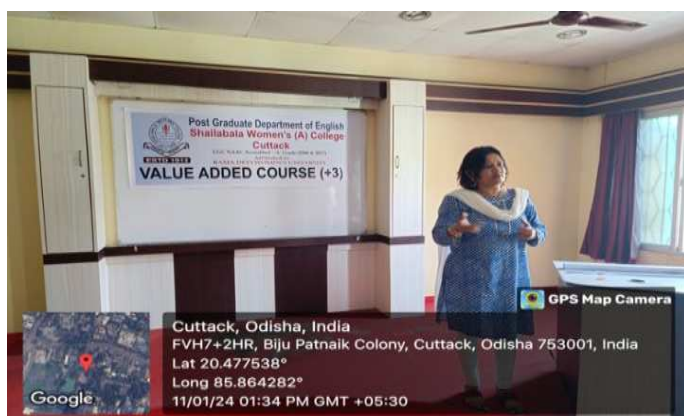
11/01/2024- INTERACTION DURING VALUE ADDED COURSE