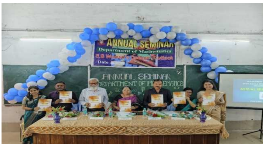
29/03/25 ANNUAL SEMINAR IN DEPARTMENT OF MATHEMATICS