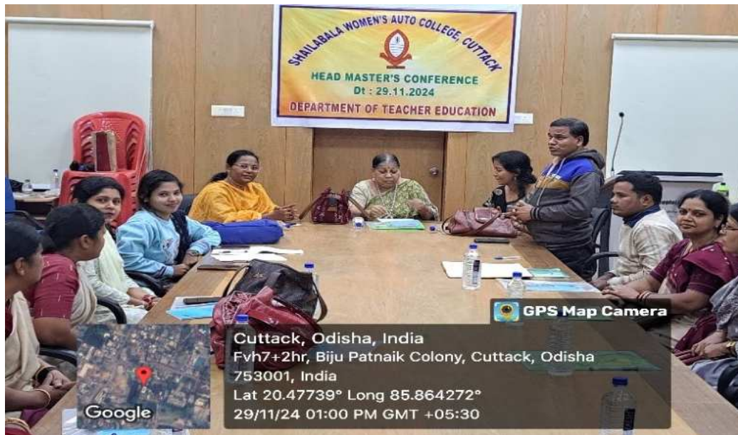
29/11/2024-HEAD MASTER'S CONFERENCE FOR SCHOOL INTERNSHIP AT DEPARTMENT OF TEACHER EDUCATION