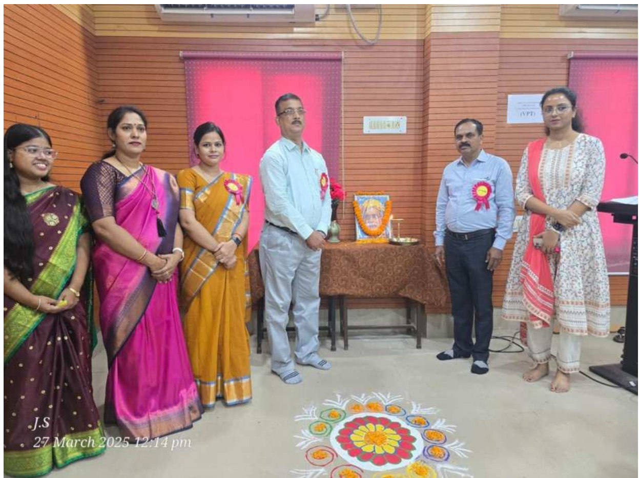
27/03/2025- ANNUAL SEMINAR IN DEPARTMENT OF PSYCHOLOGY