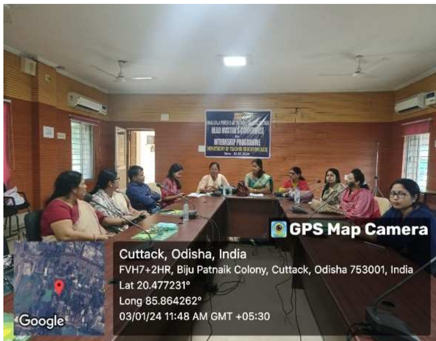
03/01/2024- HEAD MASTER'S CONFERENCE FOR SCHOOL INTERNSHIP ORGANISED BY DEPARTMENT OF TEACHER EDUCATION