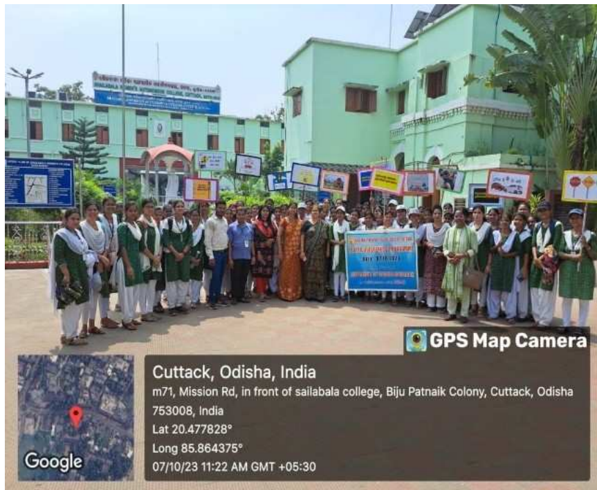
07/10/2023- TRAFFIC AWARENESS PROGRAMME BY DEPARTMENT OF TEACHER EDUCATION