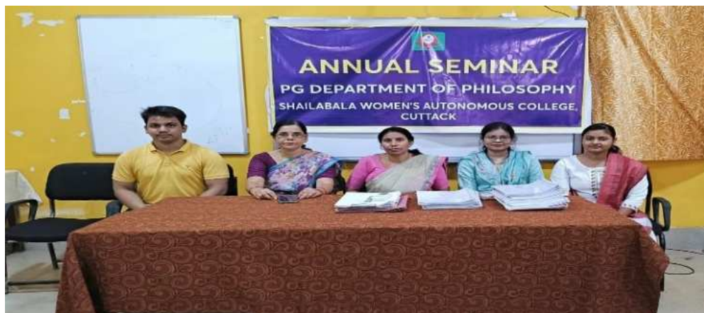
27/04/2024- ANNUAL SEMINAR BY DEPARTMENT OF PHILOSOPHY