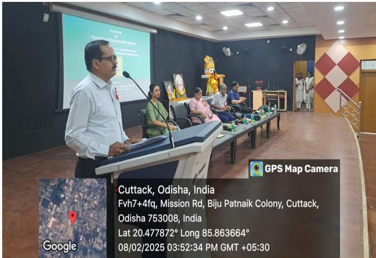
08/02/2025- SEMINAR BY DEPARTMENT OF PSYCHOLOGY